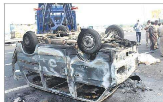
Police officers said the driver of the van tried to avoid ramming a scooter. The van overturned and caught fire.

"Six people were travelling in the van, which was headed towards Delhi. They were scheduled to take a train to Nagraj. It appears that the driver tried to avoid ramming a scooter and lost control of the vehicle. It skidded, overturned, and its ONGC cylinder caught fire. Two of the passengers